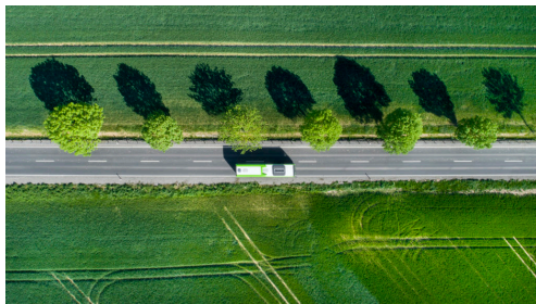
Ride Connection has undertaken planning for rural worker shuttle

Ride Connections applied its STIF funding to: