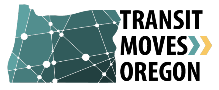
Check out the backgrounders at TransitMovesOregon.com

In the attached backgrounders, the agencies tell their stories — what they did during the pandemic, how they invested their STIF funds and where they could invest additional STIF funding if it was available.