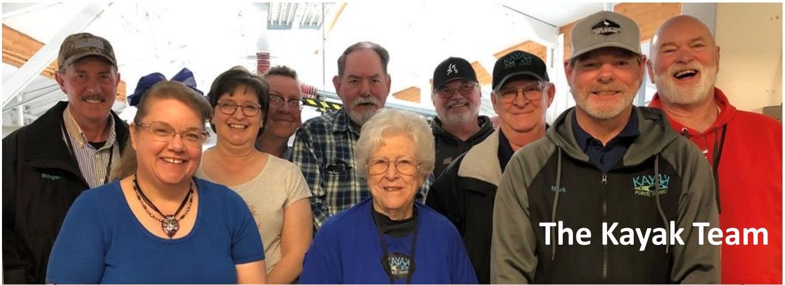
The Kayak Team